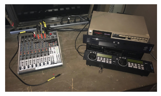
All these devices are powered on and off by the Furman Mic In Panel located on the shelf above.